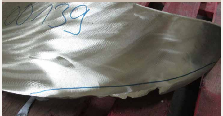
2. Revealing of the damaged area