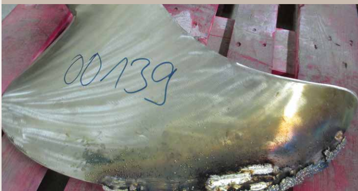
3. Welding of the damaged area